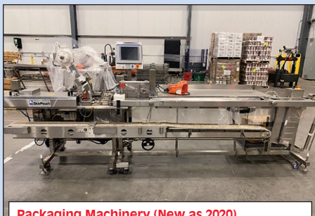
Packaging Machinery (New as 2020)