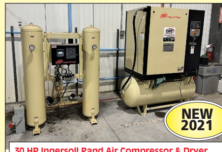
30 HP Ingersoll Rand Air Compressor & Dryer