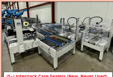
(5+) Interpack Case Sealers (New, Never Used)