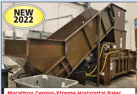
Marathon Gemini-Xtreme Horizontal Baler