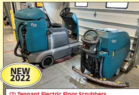
(2) Tennant Electric Floor Scrubbers