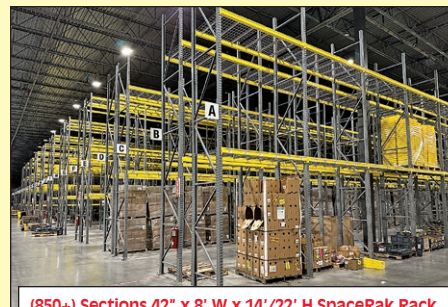
(850+) Sections 42" x 8' W x 14'/22' H SpaceRak Rack

ONLINE BIDDING ENDS: Wednesday, June 14th Starting at 10:00AM MT